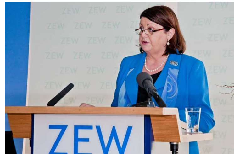
Commissioner for research, innovation and science Geoghegan-Quinn

“I want European research and innovation funding to strengthen the capacities of social innovators .”